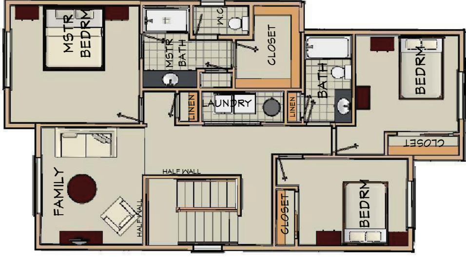
SECOND FLOOR 1204 SF