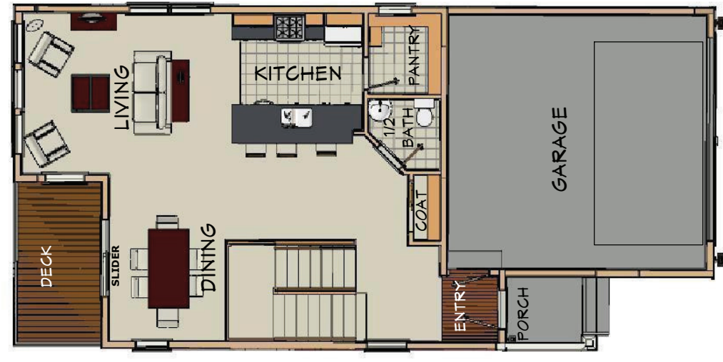
MAIN FLOOR 887 SF