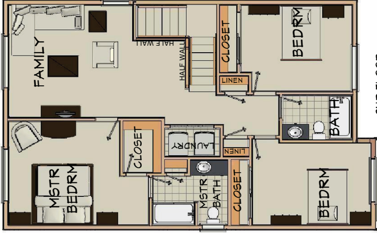
2ND FLOOR 1140 SF