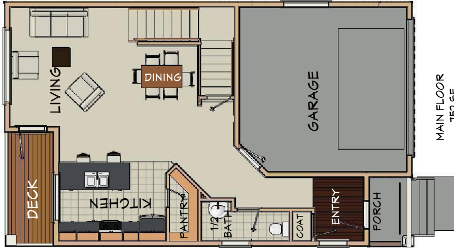
MAIN FLOOR 752 SF