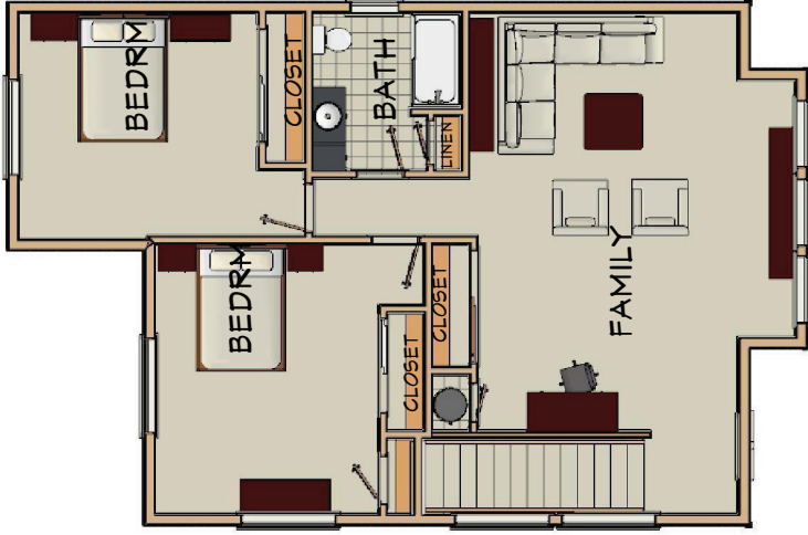
SECOND FLOOR 1071 SF