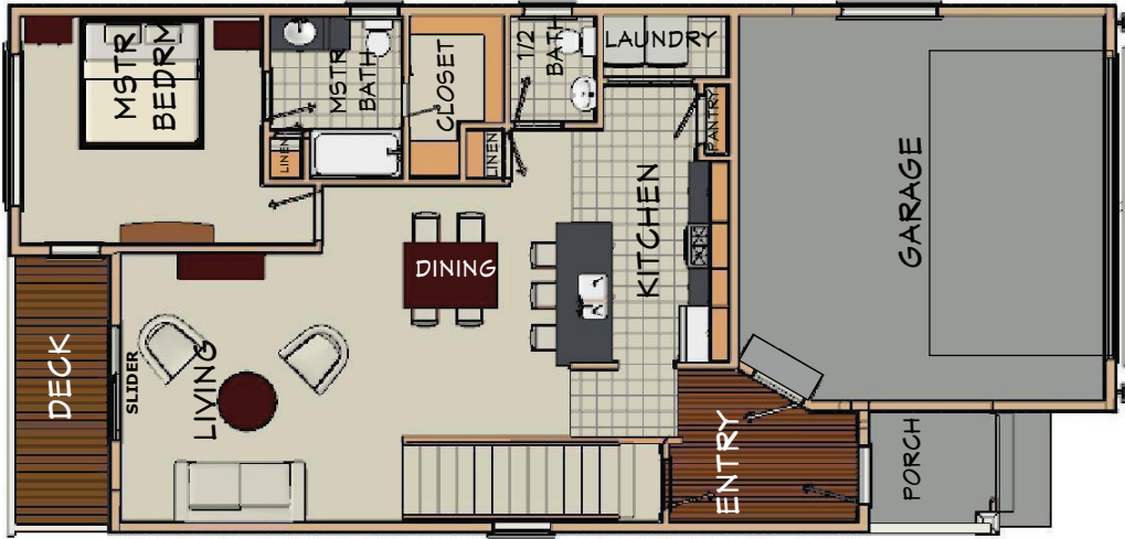
MAIN FLOOR 1069 SF